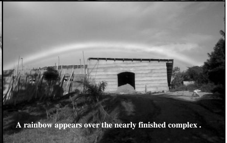
A rainbow appears over the nearly finished complex .