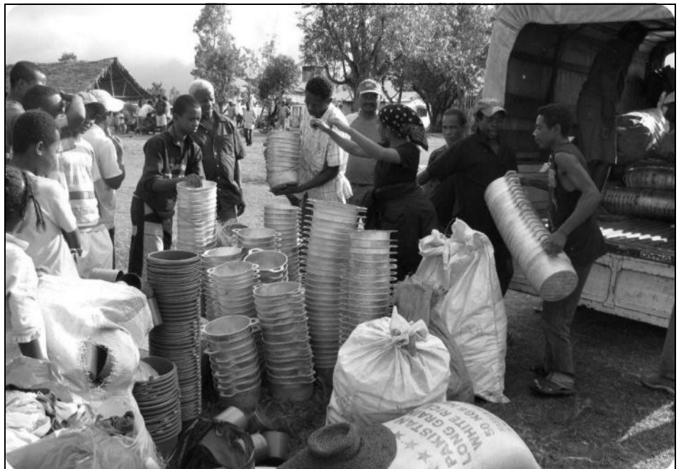
People line up to receive cookware provided by a CRMF donation.