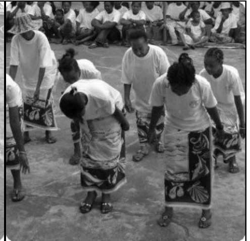
Celebration through dance