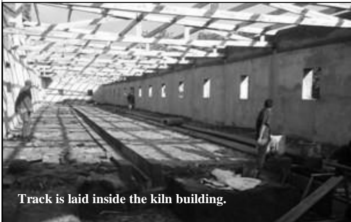
Track is laid inside the kiln building.