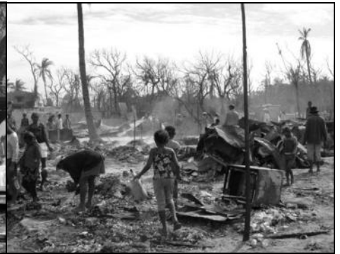
A young girl picks through remains.