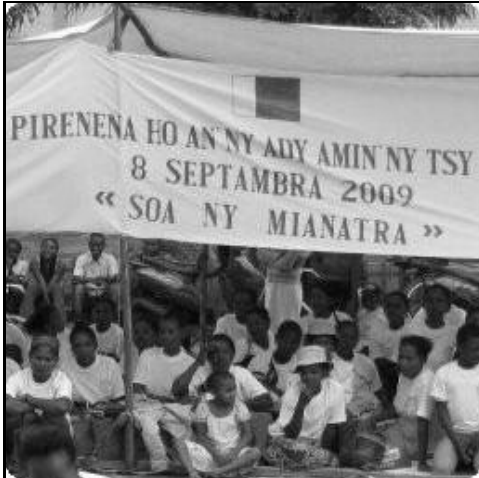
Crowds gather under the CRMF banner

It is clear that while our students come from different backgrounds and have different reasons for taking classes, they are united in their desire to learn. They apply their new skills to better their lives and the lives of those around them. We are proud of their efforts. We are also grateful for the services of the wonderful teachers whose work in our literacy and computer centers make these success stories possible.