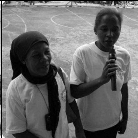
Sharing personal stories