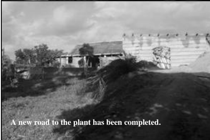
A new road to the plant has been completed.