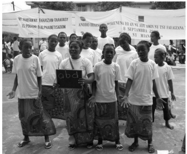
Performers at the CRMF 2009 Literacy Day celebration.

One young man, a bank employee, explained that he