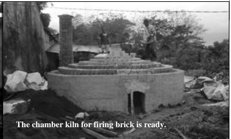
The chamber kiln for firing brick is ready.