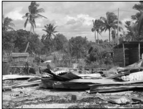
Debris smolders in the aftermath of the fire.